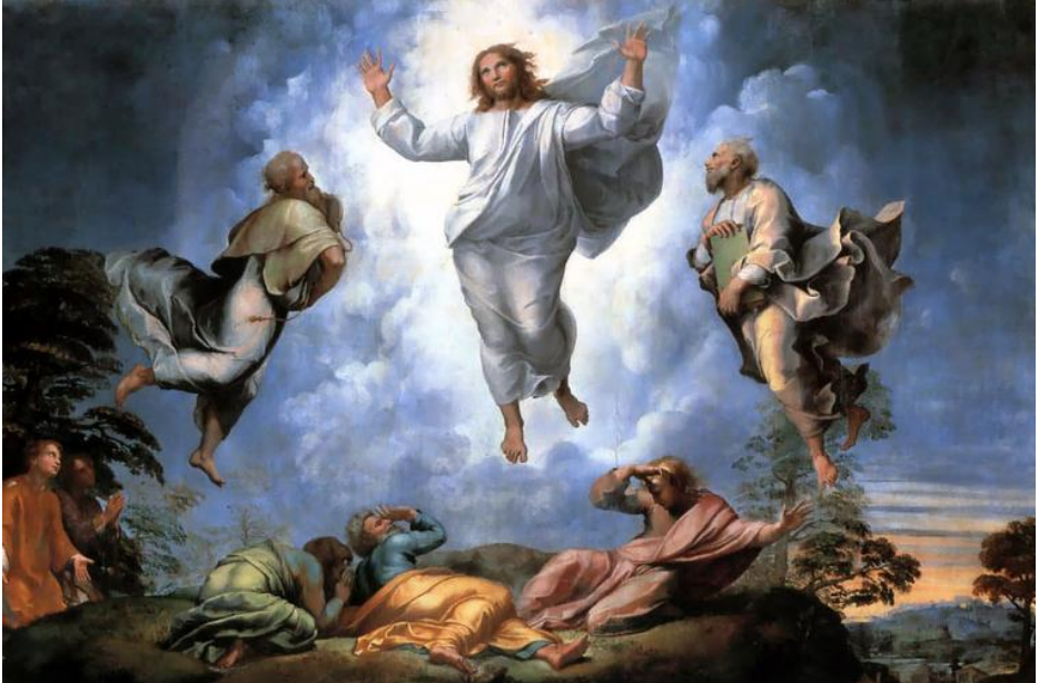
Raphael (1483-1520), "The Transfiguration"