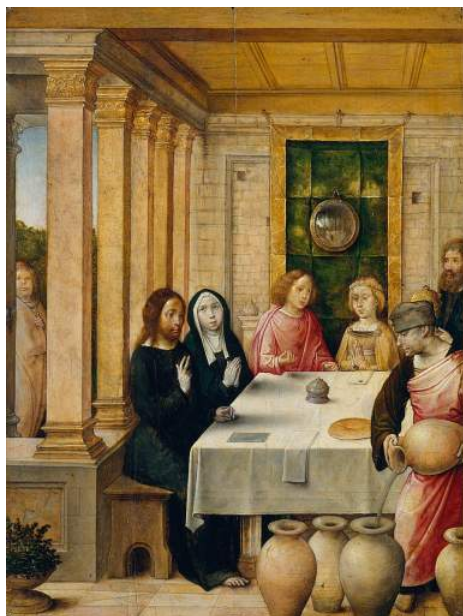
The Wedding Feast at Cana