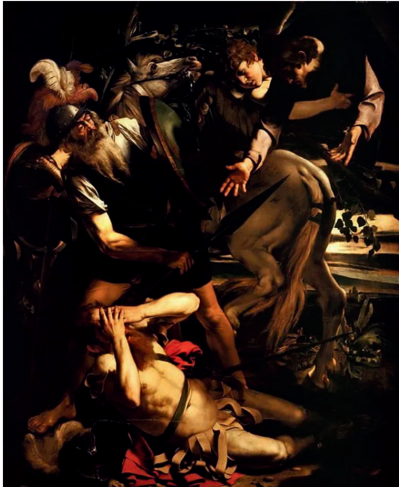
The Conversion of Saint Paul.