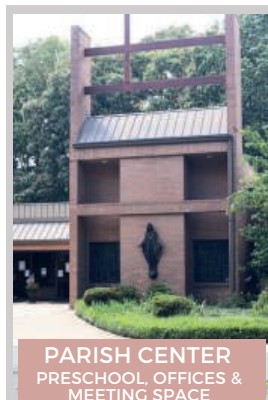
PARISH CENTER PRESCHOOL, OFFICES & MEETING SPACE

5222 Sideburn Road Fairfax, VA 22032 Parish Center Office Hours M-T 8:30am-8:30pm W-F 8:30am-4:00pm