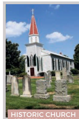
HISTORIC CHURCH CEMETERY & OLD HALL

5222 Sideburn Road Fairfax, VA 22032 Parish Center Office Hours M-T 8:30am-8:30pm W-F 8:30am-4:00pm